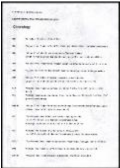
Chronology, 'Wrapped Trees, Realised and Not Realised', 1964–1998 (P09-F02-S05-0003)