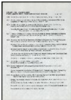
Prizes, Awards, Resolutions and Honorary Degrees, Christo and Jeanne-Claude, 1966–2009 (P09-F02-S07-0008)