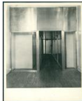
Photograph 1, 'Corridor Store Front', Photographer Unknown, 1967–68 (P09-F03-S03-0007)