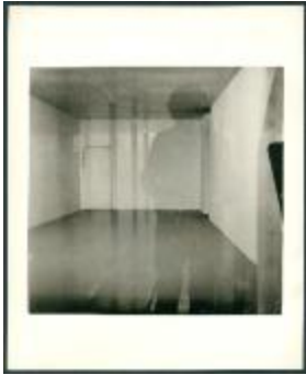
Photograph 3, 'Corridor Store Front', Photographer Unknown, 1967-68 (P09-F03-S03-0009)