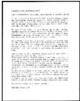
Artist Statement, Christo and Jeanne-Claude, '5,600 Cubicmetre Package, documenta IV, Kassel, Germany', 1967-68