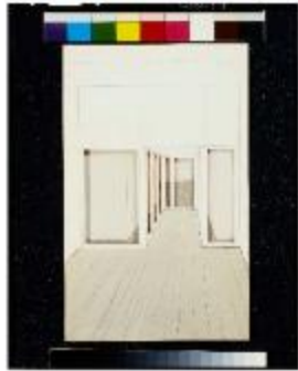
Photograph of Print, 'Corridor Store Front', Photographer Unknown, 1967-68 (P09-F03-S03-0010)