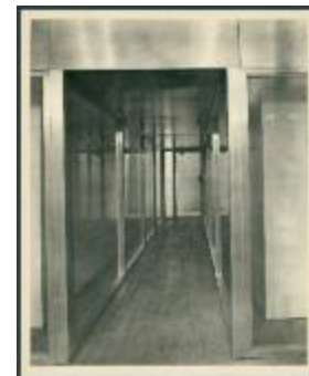
Photograph 2, 'Corridor Store Front', Photographer Unknown, 1967–68 (P09-F03-S03-0008)