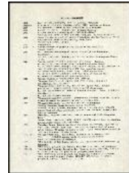
Biography, Christo, 1935–1985 (P09-F02-S03-0002)