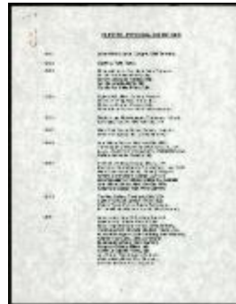
Christo – Personal Exhibitions, 1961–1990 (P09-F02-S02-0013)