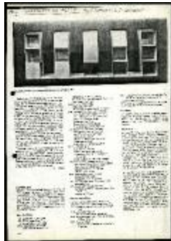
Sol LeWitt Biography Published in Contemporary Artists, 1965–1976 (P06-F01-S02-0013)