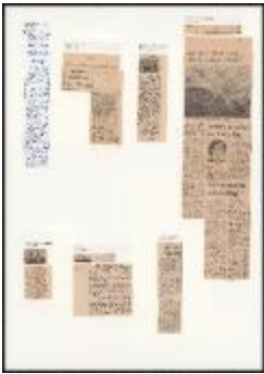
Christo and Jeanne-Claude Press Clippings, SMH, New York Times, The Sun, Daily Telegraph, 1963–69 (P01-C01-S01-0011)