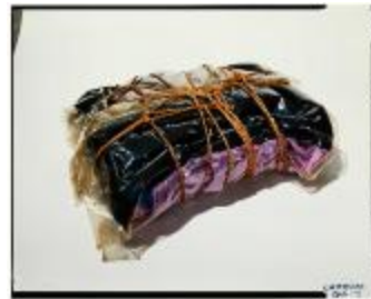
Photograph, 'Package', Unknown Photographer, 1967 (P09-F03-S03-0022)