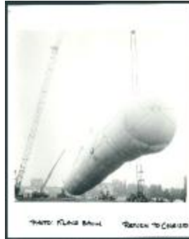
Photograph 1, '5,600 Cubicmetre Package, documenta IV, Kassel, Germany', Photographer Klaus Baum, 1967-68 (P09-