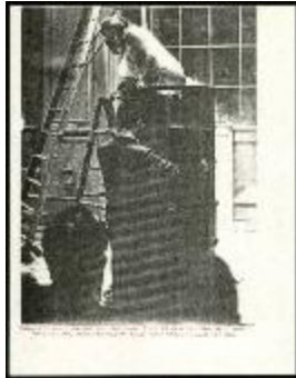
Photographs, Charlotte Moorman Performances, 1965–1973 (P05-F01-S01-0001)