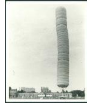
Photograph 2, '5,600 Cubicmetre Package, documenta IV, Kassel, Germany', Photographer Klaus Baum, 1967-68 (P09-