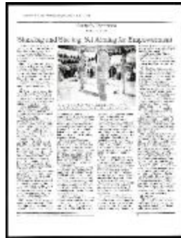
Vanessa Beecroft Press Clipping, The New York Times, 6 May 1998 (P12-F01-S02-0009)