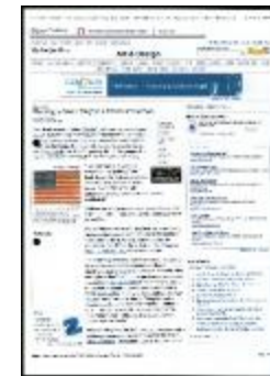
'Ringing in Summer' Stephen Vitiello Press Article, 18 Mar 2010 (P20-F01-S03-0005)