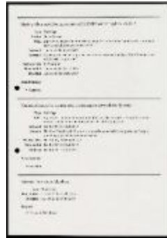
Marina Abramovi Press Coverage Summary, 2015 (P30-F02-S04-0028)