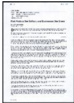
Christo and Jeanne-Claude Press Clipping, The New York Times, 14 Feb 2005 (P09-F02-S06-0011)