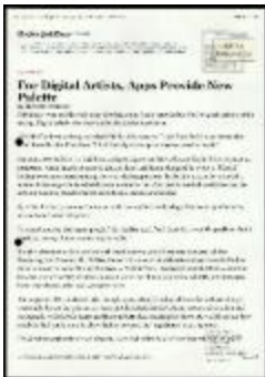
New York Times Article, 'For Digital Artists, Apps Provide New Palette', 19 Aug 2010 (P23-F01-S02-0004)