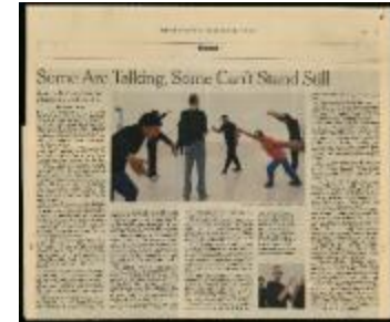
Xavier Le Roy Press Article, The New York Times, 28 Sept 2014 (P31-F01-S02-0003)