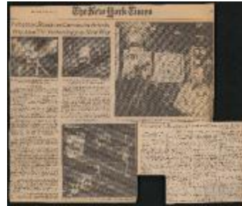
Article, 'Videotape Replaces Canvas for Artists', Grace Glueck, The New York Times, 14 Apr 1975 (P05-F01-S01-0018)