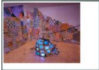
Colour Photographs of Barry McGee Installation, Rose Art Museum (P14-F01-S03-0014)