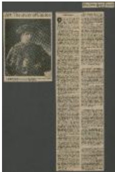
'Art: The Irony of Chirico', John Russell, New York Times, 27 Apr 1984 (P08-M01-0013)