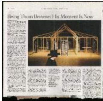
Press Clipping: 'Being Thom Browne: His Moment Is Now', The New York Times, 10 Feb 2013 (P27-F03-S01-0004)