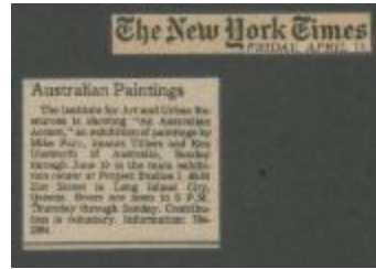
'Australian Paintings', New York Times, 13 Apr 1984 (P08-M01-0009)