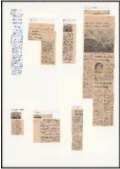
Christo and Jeanne-Claude Press Clippings, SMH, New York Times, The Sun, Daily Telegraph, 1963-69 (P01-C01-S01-0011)