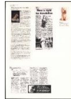
Jeff Koons Press Clippings, New York Magazine, Unknown Publications, 6 Dec 2009 (P10-C03-0027)