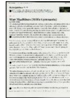
'War Machines (With Gymnasts)' Article by Carol Vogel, The New York Times, 12 May 2011 (P26-F01-S02-0002)