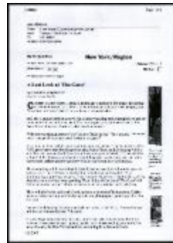
Christo and Jeanne-Claude Press Clipping, The New York Times, 28 Feb 2005 (P09-F02-S06-0012)