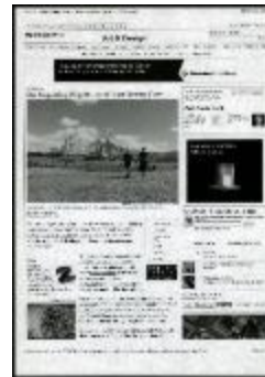
Thomas Demand Press Clipping, New York Times, 11 Aug 2011 (P25-F03-S02-0027)