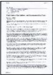
Christo and Jeanne-Claude Press Clipping, The New York Times, 14 Feb 2005 (P09-F02-S06-0011)