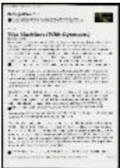
'War Machines (With Gymnasts)' Article by Carol Vogel, The New York Times, 12 May 2011 (P26-F01-S02-0002)