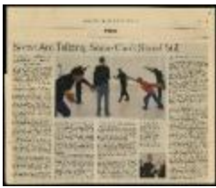
Xavier Le Roy Press Article, The New York Times, 28 Sept 2014 (P31-F01-S02-0003)