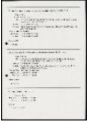
Marina Abramovi Press Coverage Summary, 2015 (P30-F02-S04-0028)