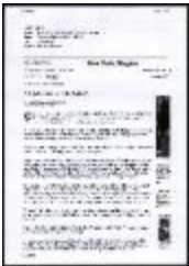
Christo and Jeanne-Claude Press Clipping, The New York Times, 28 Feb 2005 (P09-F02-S06-0012)