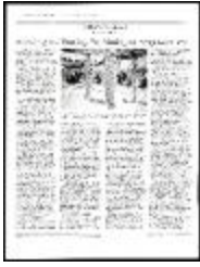
Vanessa Beecroft Press Clipping, The New York Times, 6 May 1998 (P12-F01-S02-0009)