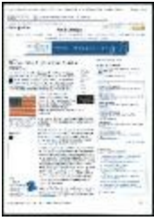
'Ringing in Summer' Stephen Vitiello Press Article, 18 Mar 2010 (P20-F01-S03-0005)