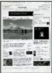
Thomas Demand Press Clipping, New York Times, 11 Aug 2011 (P25-F03-S02-0027)