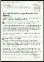
New York Times Article, 'For Digital Artists, Apps Provide New Palette', 19 Aug 2010 (P23-F01-S02-0004)