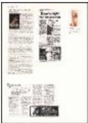
Jeff Koons Press Clippings, New York Magazine, Unknown Publications, 6 Dec 2009 (P10-C03-0027)