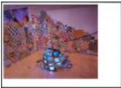
Colour Photographs of Barry McGee Installation, Rose Art Museum (P14-F01-S03-0014)