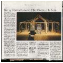
Press Clipping: 'Being Thom Browne: His Moment Is Now', The New York Times, 10 Feb 2013 (P27-F03-S01-0004)