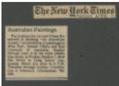
'Australian Paintings', New York Times, 13 Apr 1984 (P08-M01-0009)