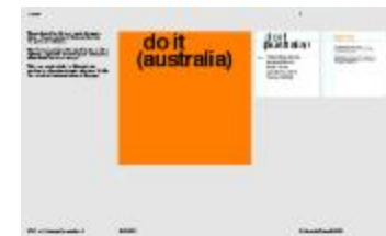
Project 36 : do it (australia) (P36)