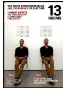
Project 27 : 13 Rooms (P27)