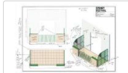
Project 28 : Roman Ondak (P28)