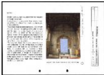
Project 17 : Bill Viola (P17)