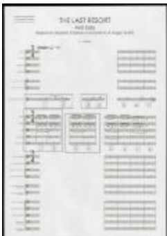
Project 33 : Anri Sala (P33)