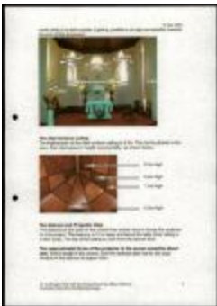
Project 21 : Bill Viola (P21)