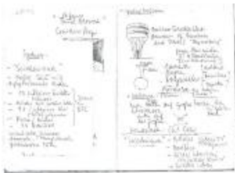
Project 25 : Thomas Demand (P25)