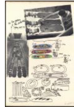
Project 04 : Miralda (P04)