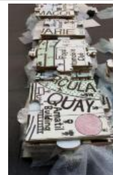
Project 24 : Michael Landy (P24)