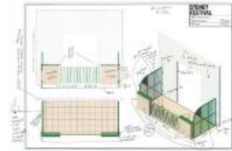
Project 28 : Roman Ondak (P28)