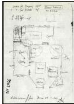
Project 02 : Harald Szeemann (P02)