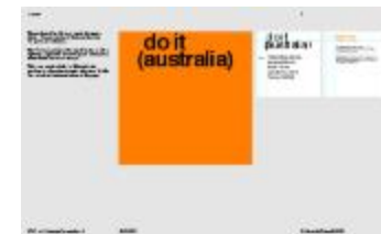
Project 36 : do it (australia) (P36)