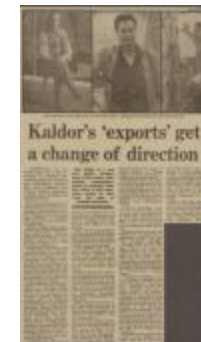
Project 08 : An Australian Accent (P08)