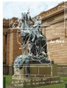
Project 19 : Tatzu Nishi (P19)