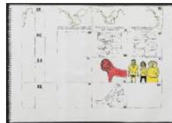
Project 35 : Making Art Public (P35)