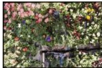
Project 10 : Jeff Koons (P10)