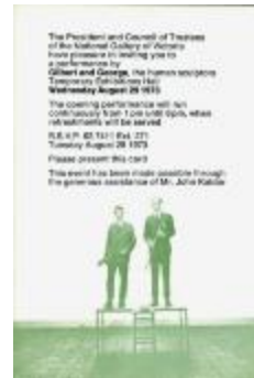
Project 03 : Gilbert & George (P03)