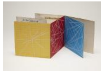
Project 06 : Sol LeWitt (P06)