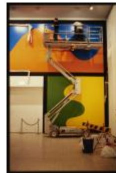
Project 11 : Sol LeWitt (P11)