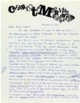
Project 05 : Charlotte Moorman and Nam June Paik (P05)