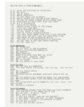
Project 12 : Vanessa Beecroft (P12)