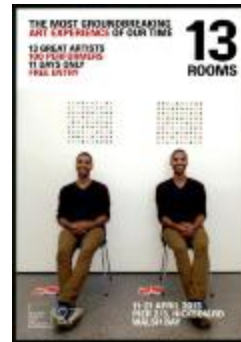
Project 27 : 13 Rooms (P27)