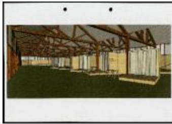
Project 30 : Marina Abramovi (P30)