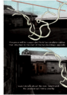
Project 15 : Urs Fischer (P15)