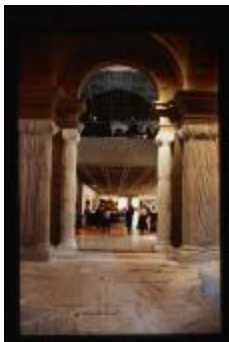
Project 09 : Christo and Jeanne-Claude (P09)