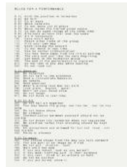
Project 12 : Vanessa Beecroft (P12)