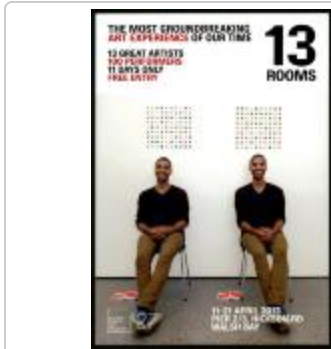
Project 27 : 13 Rooms (P27)