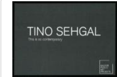
Project 29 : Tino Sehgal (P29)