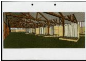
Project 30 : Marina Abramovi (P30)