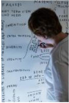
Project R01 : Education Programs (R01)