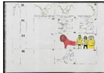
Project 35 : Making Art Public (P35)