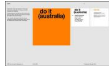
Project 36 : do it (australia) (P36)