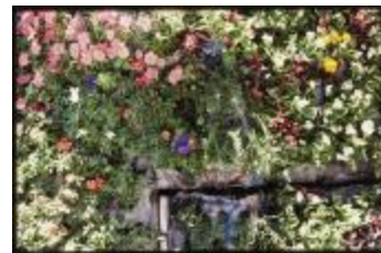
Project 10 : Jeff Koons (P10)