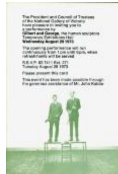
Project 03 : Gilbert & George (P03)