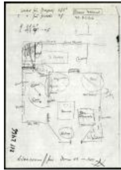
Project 02 : Harald Szeemann (P02)