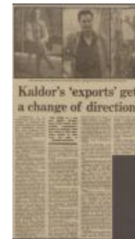
Project 08 : An Australian Accent (P08)