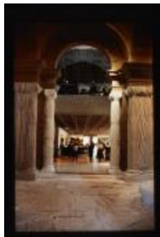
Project 09 : Christo and Jeanne-Claude (P09)