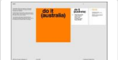
Project 36 : do it (australia) (P36)