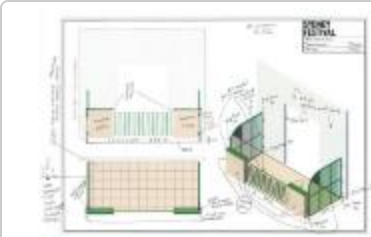
Project 28 : Roman Ondak (P28)