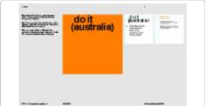
Project 36 : do it (australia) (P36)