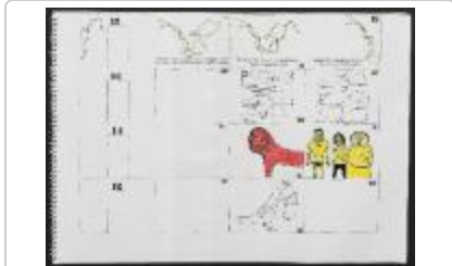
Project 35 : Making Art Public (P35)