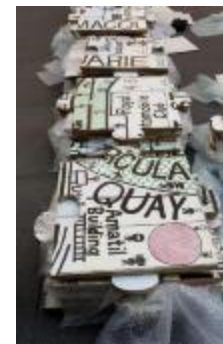
Project 24 : Michael Landy (P24)