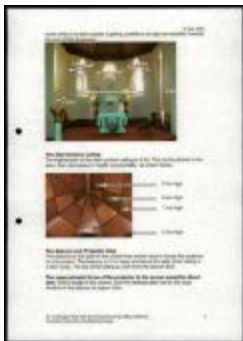
Project 21 : Bill Viola (P21)