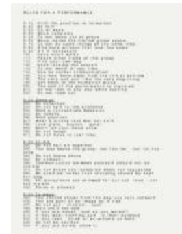
Project 12 : Vanessa Beecroft (P12)