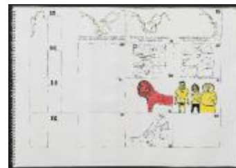
Project 35 : Making Art Public ; Michael Landy (P35)