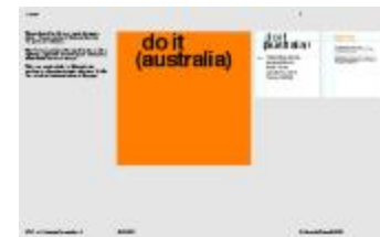
Project 36 : do it (australia) (P36)