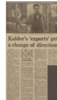
Project 08 : An Australian Accent (P08)