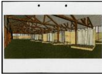
Project 30 : Marina Abramovi (P30)