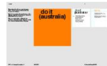
Project 36 : do it (australia) (P36)