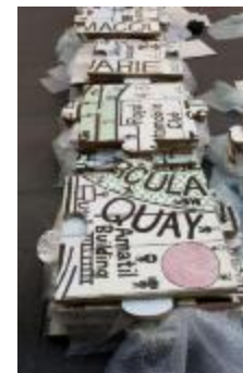
Project 24 : Michael Landy (P24)