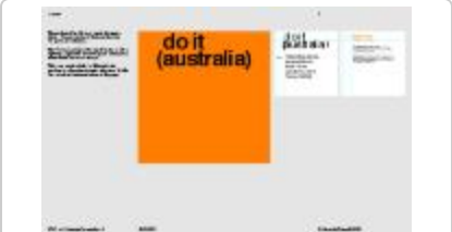
Project 36 : do it (australia) (P36)