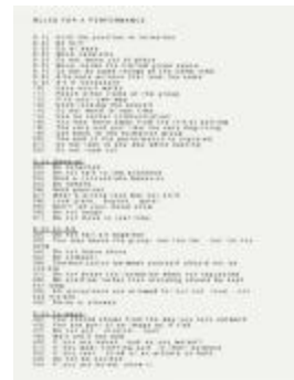
Project 12 : Vanessa Beecroft (P12)