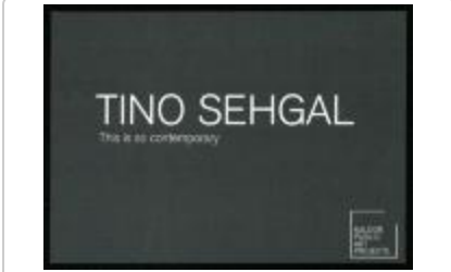
Project 29 : Tino Sehgal (P29)