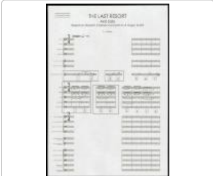
Project 33 : Anri Sala (P33)