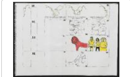
Project 35 : Making Art Public (P35)