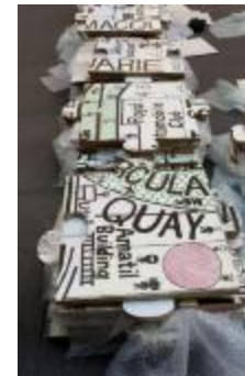
Project 24 : Michael Landy (P24)