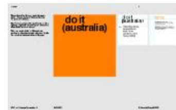
Project 36 : do it (australia) (P36)