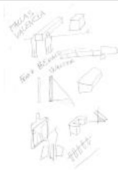
Project 22 : Santiago Sierra (P22)