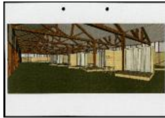
Project 30 : Marina Abramovi (P30)