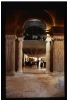
Project 09 : Christo and Jeanne-Claude (P09)