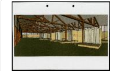
Project 30 : Marina Abramovi (P30)