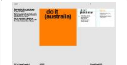
Project 36 : do it (australia) (P36)