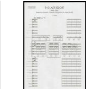
Project 33 : Anri Sala (P33)