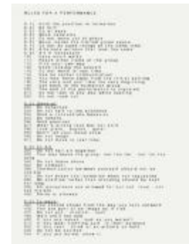
Project 12 : Vanessa Beecroft (P12)