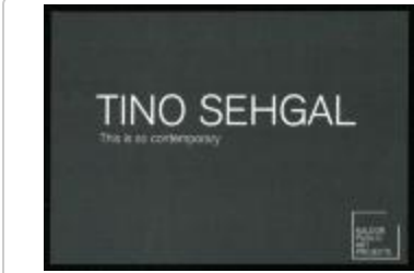
Project 29 : Tino Sehgal (P29)