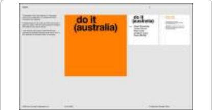
Project 36 : do it (australia) (P36)