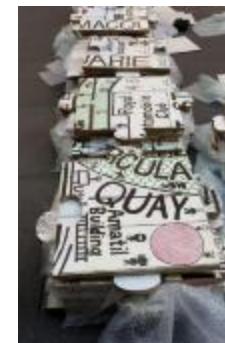
Project 24 : Michael Landy (P24)