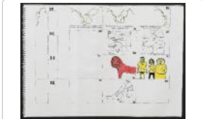
Project 35 : Making Art Public ; Michael Landy (P35)