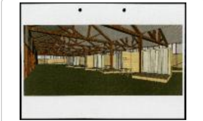
Project 30 : Marina Abramovi (P30)