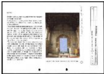
Project 17 : Bill Viola (P17)