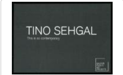
Project 29 : Tino Sehgal (P29)