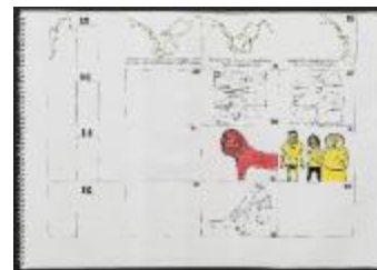
Project 35 : Making Art Public ; Michael Landy (P35)