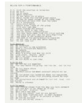
Project 12 : Vanessa Beecroft (P12)