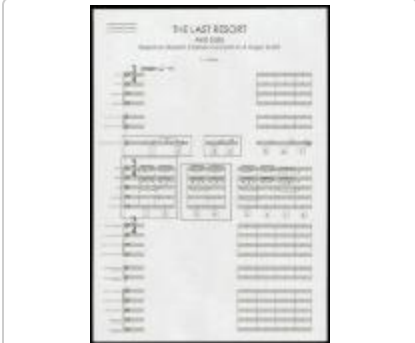
Project 33 : Anri Sala (P33)