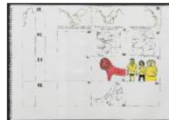
Project 35 : Making Art Public ; Michael Landy (P35)