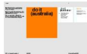
Project 36 : do it (australia) (P36)