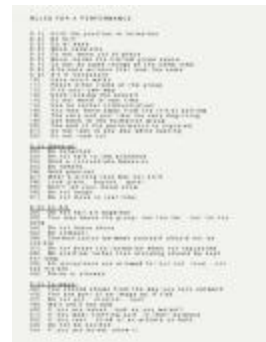
Project 12 : Vanessa Beecroft (P12)