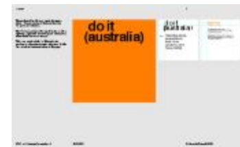
Project 36 : do it (australia) (P36)