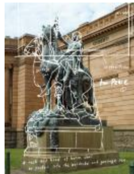
Project 19 : Tatzu Nishi (P19)