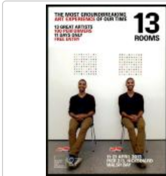
Project 27 : 13 Rooms (P27)