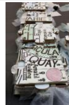
Project 24 : Michael Landy (P24)