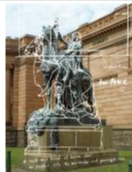
Project 19 : Tatzu Nishi (P19)