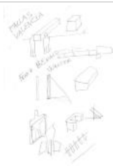
Project 22 : Santiago Sierra (P22)