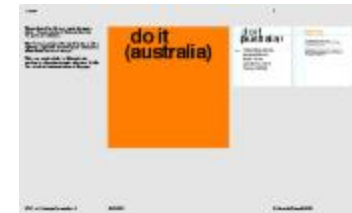
Project 36 : do it (australia) (P36)