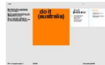
Project 36 : do it (australia) (P36)