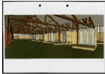
Project 30 : Marina Abramovi (P30)