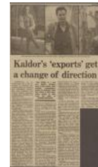
Project 08 : An Australian Accent (P08)