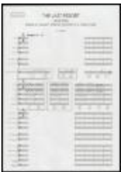
Project 33 : Anri Sala (P33)