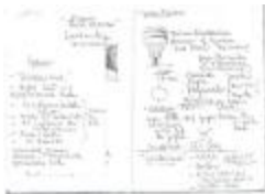
Project 25 : Thomas Demand (P25)