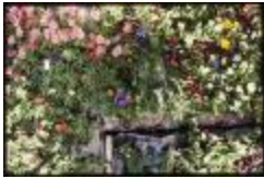
Project 10 : Jeff Koons (P10)