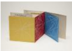
Project 06 : Sol LeWitt (P06)