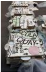
Project 24 : Michael Landy (P24)