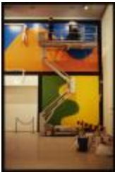
Project 11 : Sol LeWitt (P11)