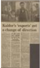
Project 08 : An Australian Accent (P08)