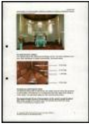
Project 21 : Bill Viola (P21)