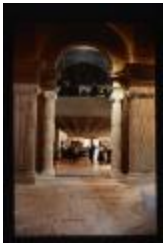
Project 09 : Christo and Jeanne-Claude (P09)