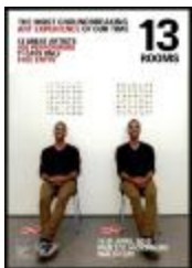
Project 27 : 13 Rooms (P27)