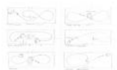
Project 26 : Allora & Calzadilla (P26)