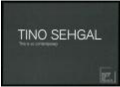
Project 29 : Tino Sehgal (P29)