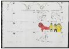
Project 35 : Making Art Public (P35)