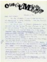
Project 05 : Charlotte Moorman and Nam June Paik (P05)