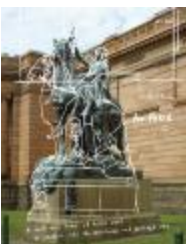
Project 19 : Tatzu Nishi (P19)