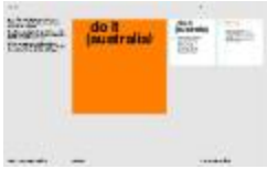
Project 36 : do it (australia) (P36)