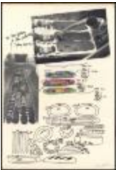
Project 04 : Miralda (P04)