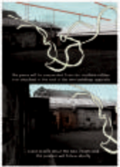
Project 15 : Urs Fischer (P15)