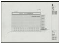
Project 23 : John Baldessari (P23)