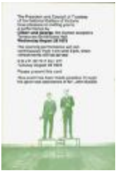
Project 03 : Gilbert & George (P03)