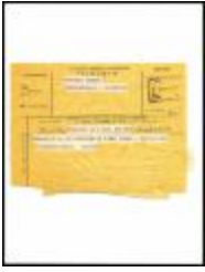
Project 01 : Christo and Jeanne-Claude (P01)