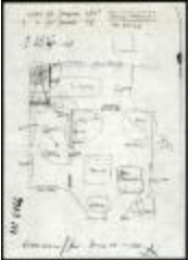
Project 02 : Harald Szeemann (P02)