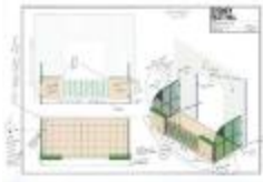
Project 28 : Roman Ondak (P28)