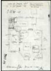
Project 02 : Harald Szeemann (P02)