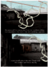
Project 15 : Urs Fischer (P15)