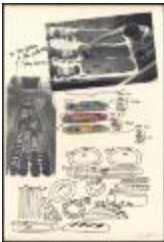
Project 04 : Miralda (P04)