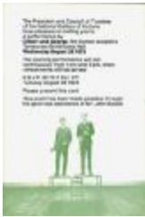
Project 03 : Gilbert & George (P03)