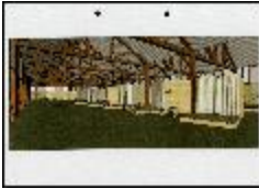
Project 30 : Marina Abramovi (P30)