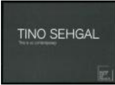
Project 29 : Tino Sehgal (P29)