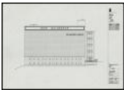
Project 23 : John Baldessari (P23)