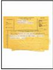
Project 01 : Christo and Jeanne-Claude (P01)