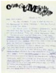
Project 05 : Charlotte Moorman and Nam June Paik (P05)