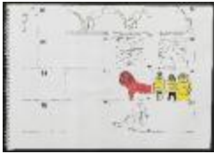
Project 35 : Making Art Public ; Michael Landy (P35)